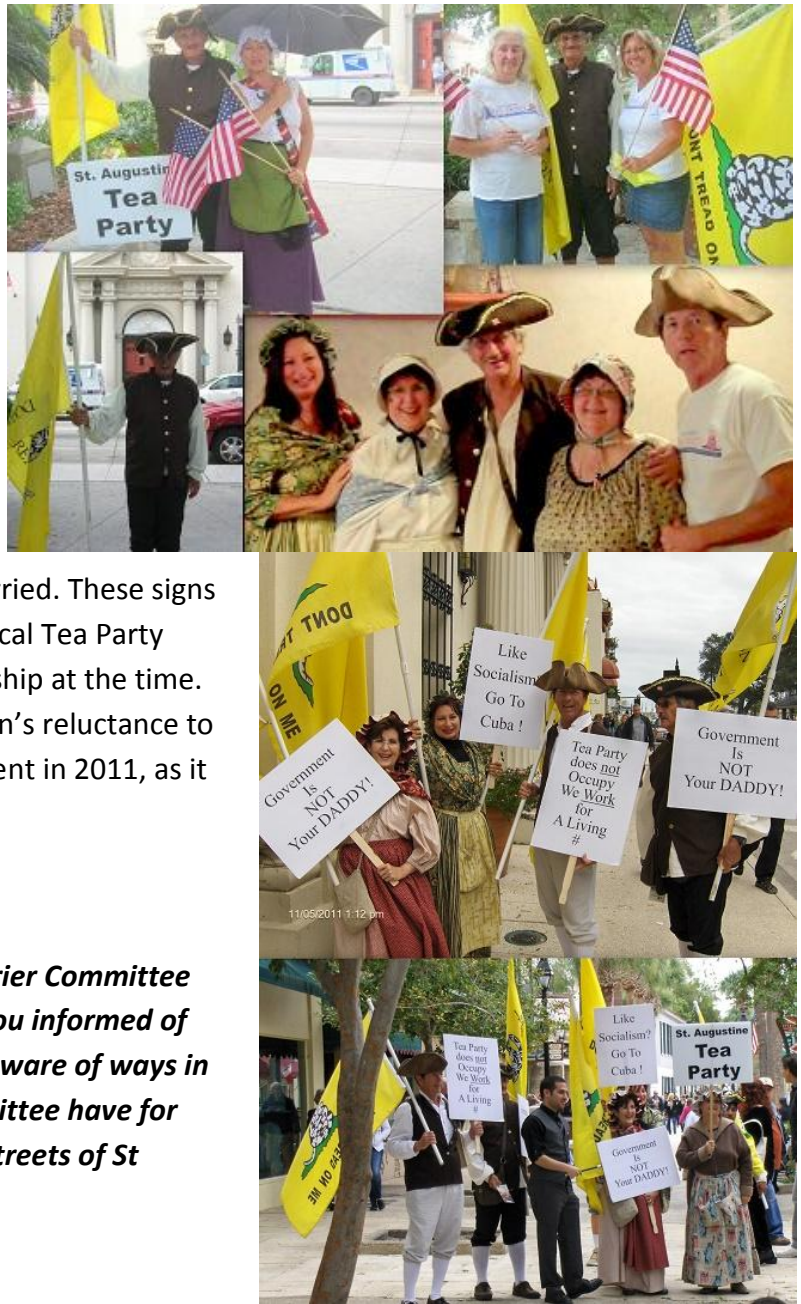
October 2011

"We dress in period clothes and walk the streets while boldly full presenting size Gadsden Flags. The sight of Revolutionary period clothing and the bright yellow flags give us the opportunity to promote the Tea Party, to educate the public on the values of the Tea Party and the lessons that can be learned from The Declaration of Independence and the Constitution of the United States, which we pass out as we move among the people. It is this one to one public contact with the people which inspires Committee members to continue their efforts. We are blessed to see the awaking of America first hand."